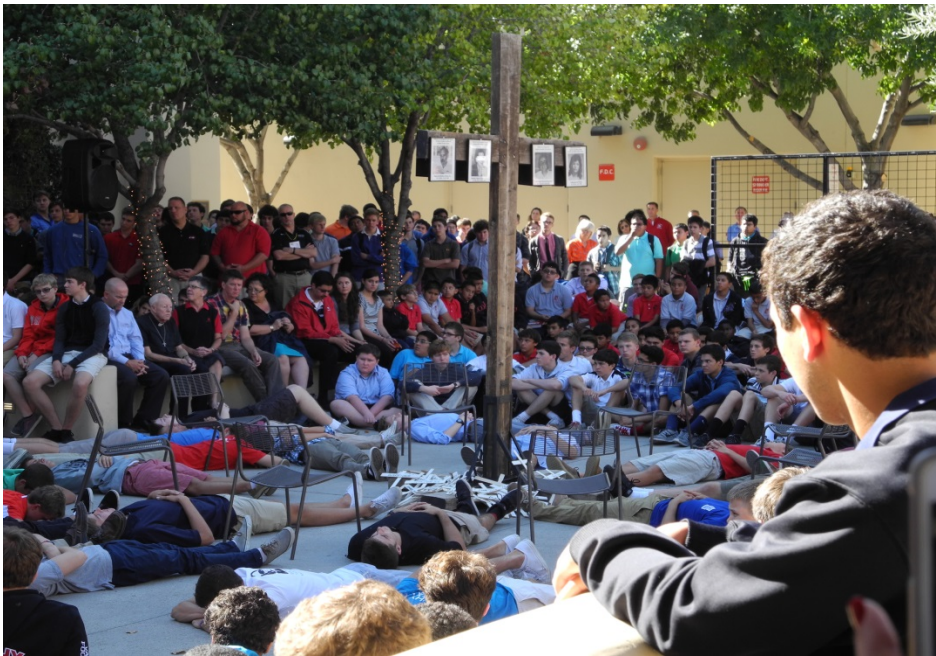
Prayer Service at Brophy Prep remembering the martyrs of El Salvador. Participants at the Principals' conference attended the service during their time in Arizona.